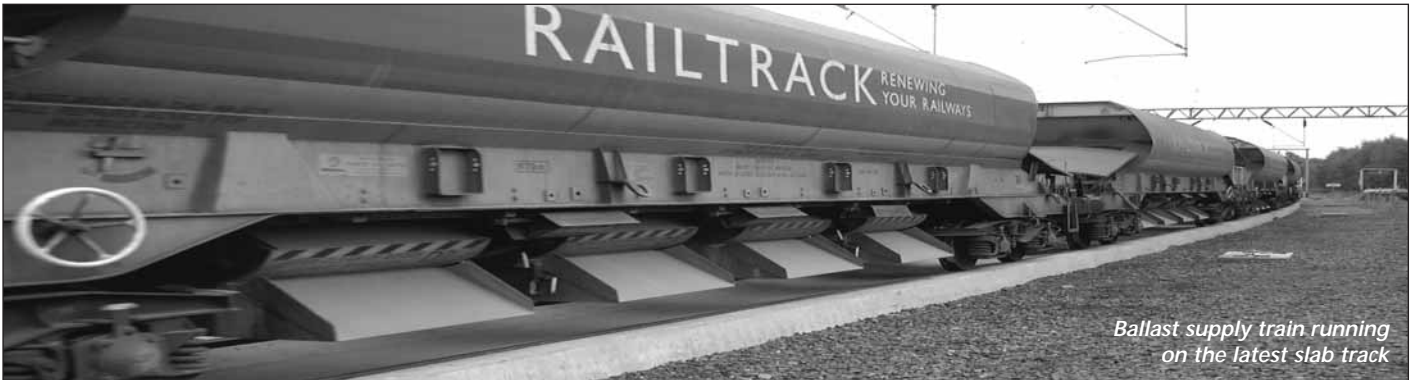
Ballast supply train running on the latest slab track

As reported in the Summer issue of Britpave News , Network Rail is to test a type of track that will not buckle in the heat and would prevent derailments such as the one that caused the Hatfield crash. The slab track rails are set in continuous reinforced concrete channel rather than being attached to railway sleepers resting on conventional ballast.