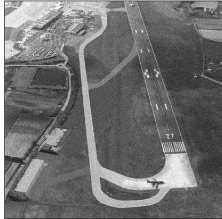
Jersey Airport, before and after completion of the new taxiway

Taxiway Alpha at Jersey Airport was of inadequate strength and had become uneconomic to maintain. Additionally, it was not far enough from the runway to comply with current safety standards. To cope with future air traffic and the safety aspects, the decision was taken to realign and strengthen this taxiway.