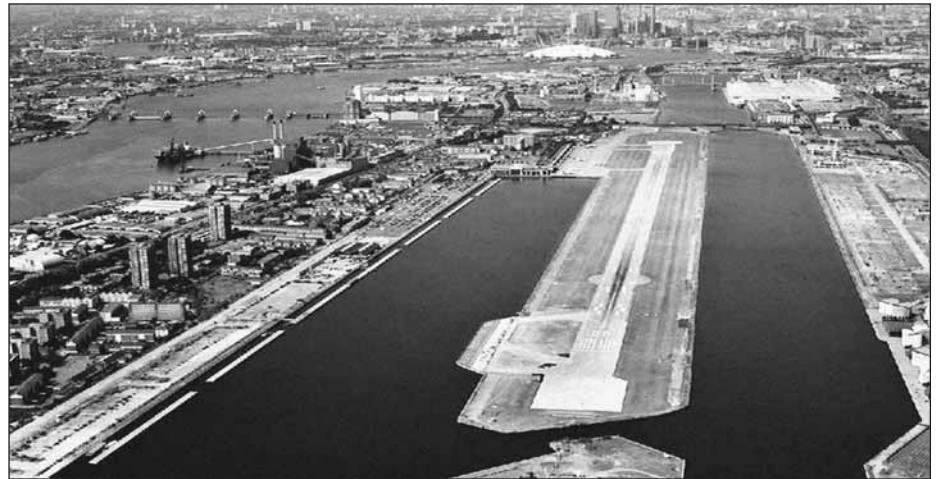
London City airport showing the new holding area in the foreground

The height and safety restrictions imposed by working near to a live airfield meant that the work had to be carefully planned to allow continued operations through the planned 12 month construction period. The larger scale