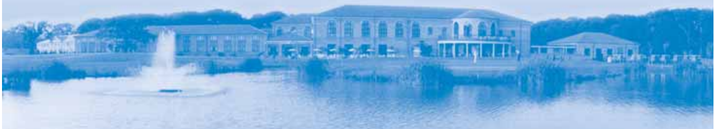
De Vere Belton Woods Hotel, Grantham