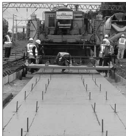
Starter bars provide secure fixing for reinforcement cage